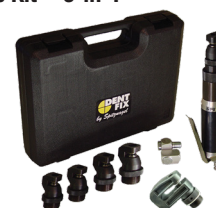
DFMP050K Pneumatic Punch/ Flange Kit - 6-in-1