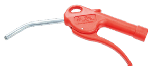
ABG100 AirBoy Blow Gun - 100mm