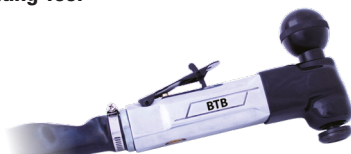
OHBR63 Oscillating Round Saw Blade - Ø63mm