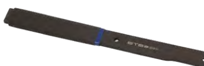
SB910 SeamBuster Chisel with V-Notch

✳ V-Cut profile helps locate on spot welds