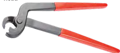
426801 Door Skinning Pliers Narrow Head

✳ These narrow head pliers make it possible to remove the edging from car door skins to repair inner panels. The first active jaw progressively lifts the door skin/flange allowing access for the wider jaw pliers.