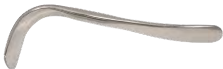
SD1031 Double Blade L Hook Spoon