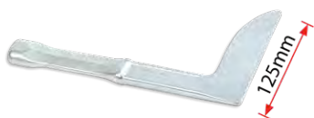
SD2542 Offset Bolster Chisel