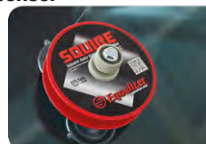
WRD-LP WRD Cutting Line Holder Pins - Pkt 4

Comes with 50m HD Squire Wire Roll #STL166