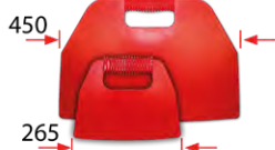
WDPSET Wire Cut-Out Dash Protector Set - 2 Pc