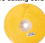
TOUGH LINE PRO Oz Tough Line Pro Cutting Cord - 150m