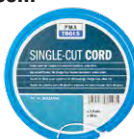
FIBRE LINE0.6 Ultra Thin Fibre Line - 50m