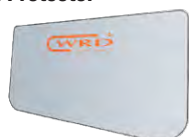
WRD-DPXL WRD Extra Large Dash Protector