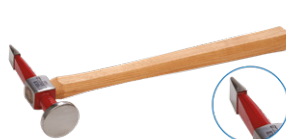
SH5651 Straight Pein Finishing Hammer