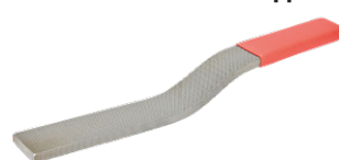
SD7001 Medium Grade Flipper