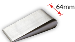
HD1066 Wedge Dolly