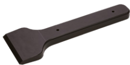
SD6123 Bolster Head Nylon Dolly - 95mm Wide