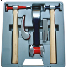
PBRK6 Panel Hammer & Dolly Repair Kit - 6 Pc