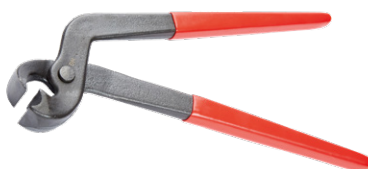
426800 Door Skinning Pliers Wide Head

✳ The wide head pliers peel back the flange lip to right angles to allow access to repair the inner framework.