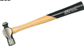
HMBP12 Ball Pein Hammer 12oz