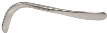
SD1031 Double Blade L Hook Spoon - 410mm Long