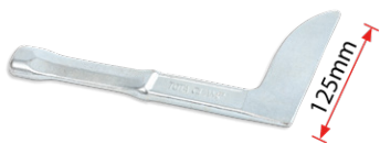
SD2542 Offset Bolster Chisel