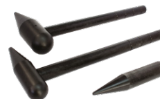
NCRH30 Nylon Hammer Set - 3 Pc