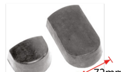
SD5033 Rubber Dolly Kit - 2 Pc