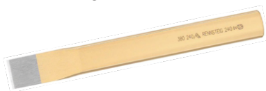
380240C Slitting Chisel - 240 x 26mm