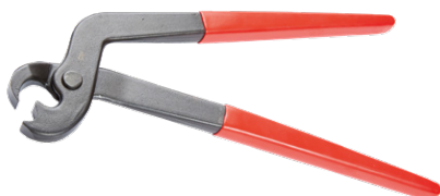
426801 Door Skinning Pliers Narrow Head

✳ The narrow head pliers make it possible to remove the edging from car door skins to repair inner panels.