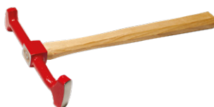
SH7501 Door Skin Hammer